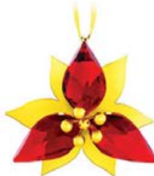
Poinsettia Ornament Swarovski Price ₹ 2510