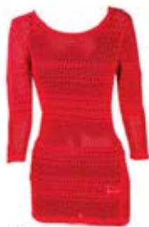
LEVIS sweater Price ₹ 2199