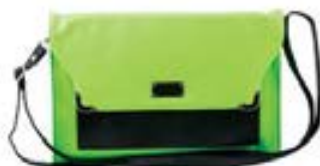
Miss She Ladies Bag Price ₹ 639