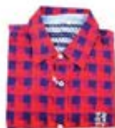
Geordano Mens shirt Price ₹ 1895