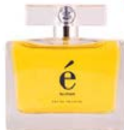
E' Perfume Shaze Price ₹ 3650