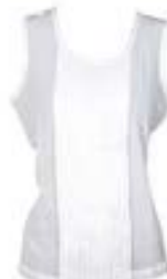
U.S Polo ladies top Price ₹ 1399