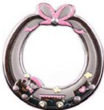
Train kids picture frame Shaze Price ₹ 3220