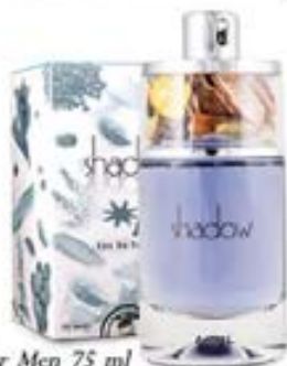
Shadow for Men 75 ml Ajmal Perfumes Price ₹ 2300