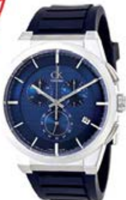
Men's Dart Watch Calvin Klein Watches Price ₹ 27800