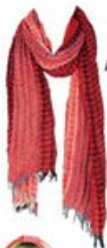
UB Ladies stole Price ₹ 165