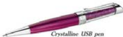
Crystalline USB pen Swarovski Price ₹ 2890

Disclaimer: Price and features are subject to change. Buyers are advised to act on data after cross-checking.