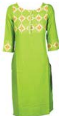
W Ladies Kurta Price ₹ 1499