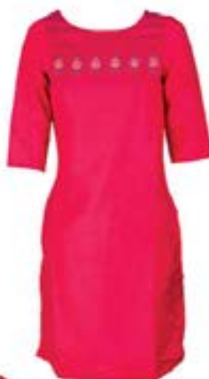
W Ladies Kurta Price ₹ 1099