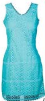
Latin Quarters Price ₹ 2199