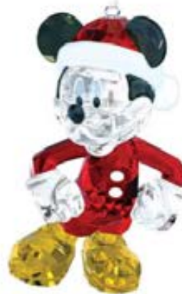
Crystal Santa Mickey Swarovski Price ₹ 11240