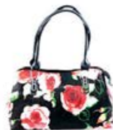
Miss She Ladies Bag, Price ₹ 1199