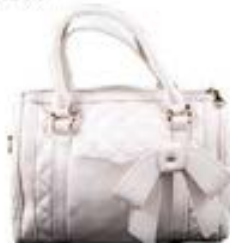
Yivvu Ladies Bag Price ₹ 1049