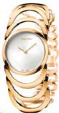
Ladies Bracelet Watch Calvin Klein Watches Price ₹ 22600