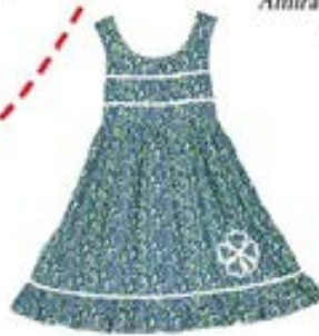
Happy Face frock Price ₹ 779