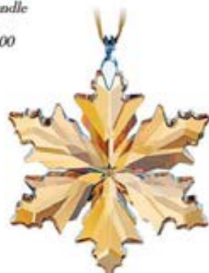
Snowflake ornament Swarovski Price ₹ 4710