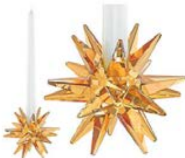
Crystal star candle holder Swarovski Price ₹ 22260