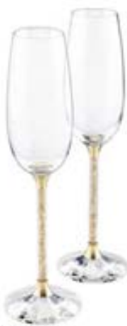
Crystal toasting flutes Swarovski Price ₹ 24080