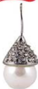
Silver Saga Earrings Shaze Price ₹ 2650