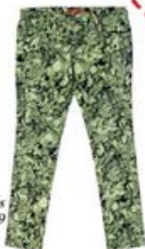
Lee Cooper ladies pants Price ₹ 1599