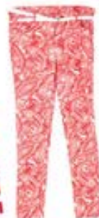
L2K Ladies pants Price ₹ 799