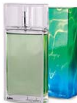
Chemistry for men 90 ml Ajmal Perfumes Price ₹ 1800