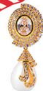
Pearl drop earrings Shaze Price ₹ 4980