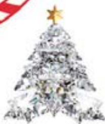
Crystal tabletop christmas tree Swarovski Price ₹ 22260