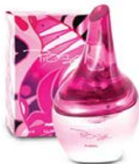
Prose for Women 60 ml Ajmal Perfumes Price ₹ 2700