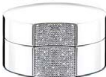
Crystal Ambiray Jewellery Box Swarovski Price ₹ 6790