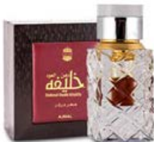
Dahnul Oudh Khalifa 3 ml Ajmal Perfumes Price ₹ 4000