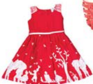
Doodle Girls Frock Price ₹ 999