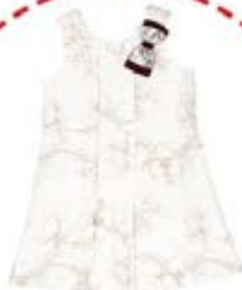
Happy Face frock Price ₹ 1199