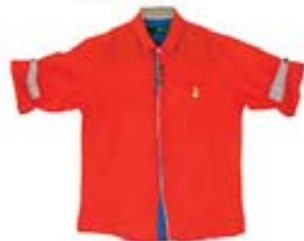
Chase Boys Shirt Price ₹ 1375