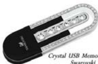
Crystal USB Memory Stick Swarovski Price ₹ 5670