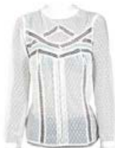
Latin Quarters top Price ₹ 1350