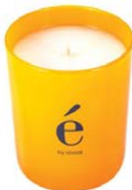
Perfumed candle Shaze Price ₹ 2500