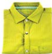
Identiti Mens Shirt Price ₹ 1499