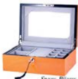
Srazy Bijoux box Shaze Price ₹ 18520