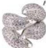
Twirl ring Shaze Price ₹ 2000